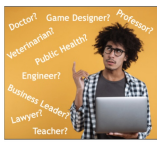
Image description: Person with black hair and glasses standing, holding a laptop in left hand, and pointing the index finger of right hand in the air. Around the person's head in white text on orange background are the words: Doctor? Game Designer? Professor? Veterinarian? Public Health? Engineer? Business Leader? Lawyer? Teacher?

Explore your options at Virginia Tech's Virtual Graduate and Professional School Fair Monday, October 4, 2021, 11:00am – 3:00pm Registration details: https://tinyurl.com/GPSF-2021 You will meet recruiters from competitive graduate programs located around the nation! You will also have a chance to win free raffle prizes from local Blacksburg businesses.